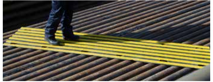
Long Tread Pipewalker (STP)