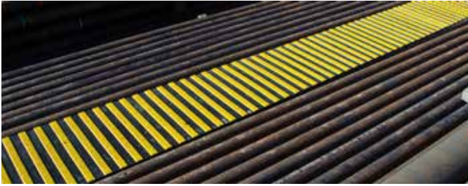
Short Tread Pipewalker (STP)