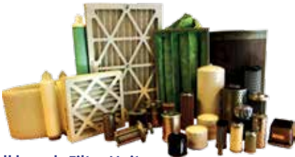
All brands Filter Units for • Engine • HVAC • Process & Diesel